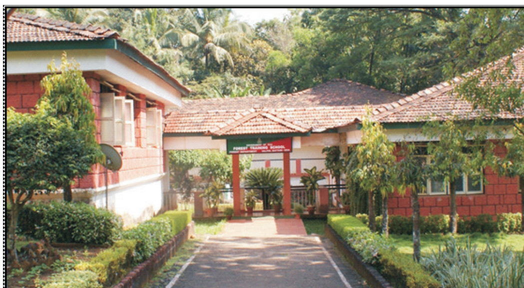
Forest Training School at Valpoi

The campus also houses a Tissue Culture Laboratory where micro-propagation of woody tree species and rare orchids are being carried out by the Research and Utilisation Division. Research projects by different colleges are also supported by the Forest Training School.