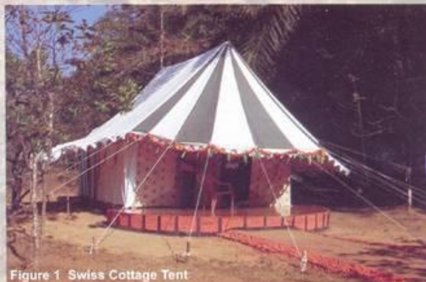
Figure 1 Swiss Cottage Tent

For booking and inquiries, contact the Office of the Dy. Conservator of Forests, Wildlife & Eco-Tourism, Panaji (0832-2229701) or the Office of the Range Forest Officer, Wildlife, Molem, (0832-2602211).