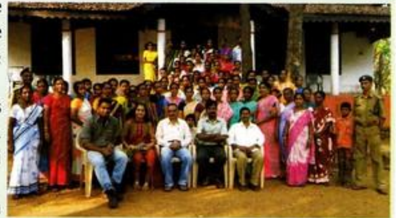
Nature awareness camp at Bondla Wildlife Sanctuary for self help groups around sanctuary

The Villagers of Cotigao wards were taken on a study tour to Bhagwan Mahaveer Wildlife Sanctuary to give them exposure to Nandran rehabilitation program carried out by the Forest Department.