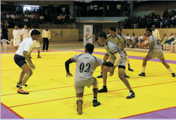
GOA Kabaddi team during their Q. Final Match against Haryana Team