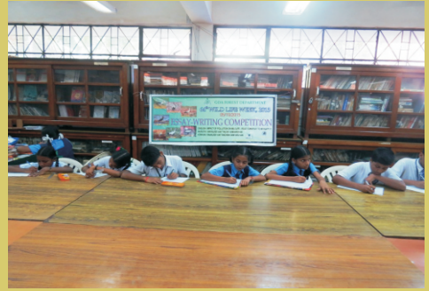
Essay writing in progress