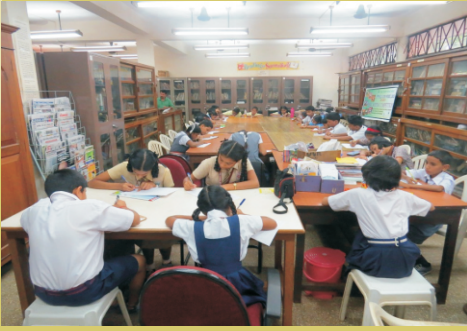
Essay competition in progress