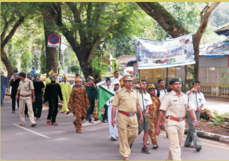
Awareness rally in Panaji