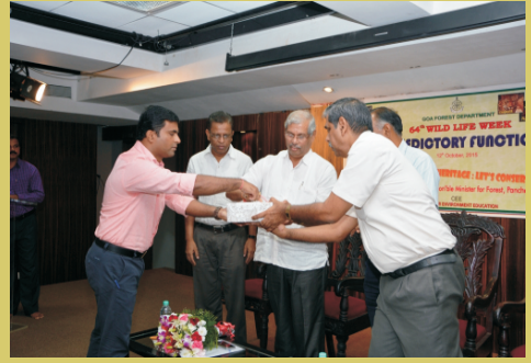
Release of souvenirs at the function