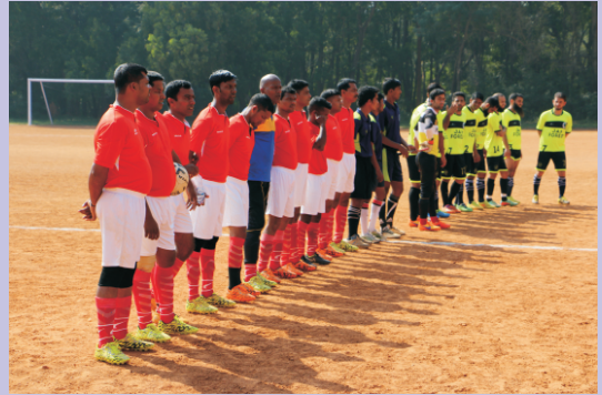
GOA Football team during their Final Match against J & K Team