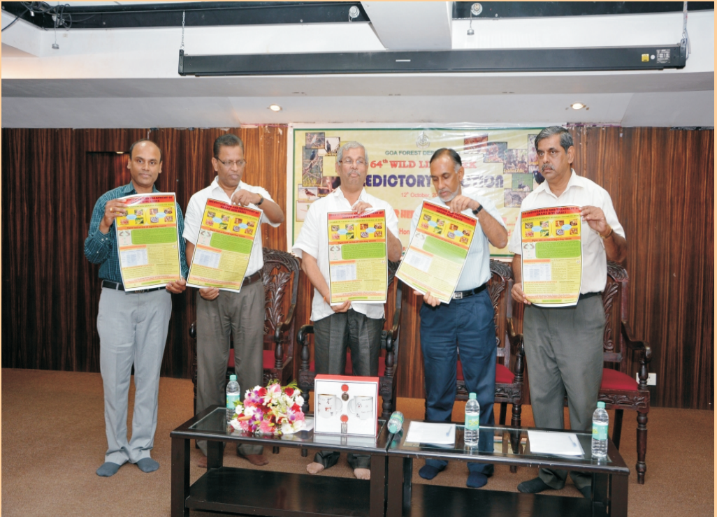
Poster on snake awareness released by the Hon'ble Forest Minister

An insight on the various activities that were solemnized during the Wildlife week 2015 were as follows.