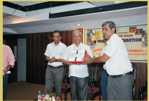
Release of coffee mug souvenir