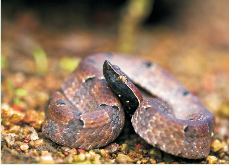
Hump nosed pit viper