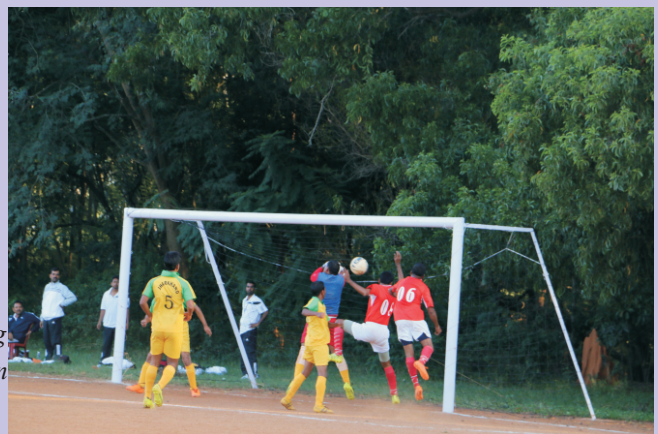
GOA Football team while scoring 0 goal against Jharkhand Team in Final Match