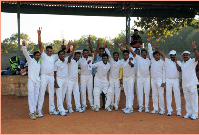
GOA Cricket team in jubilant mood after winning the first Match against Maharashtra