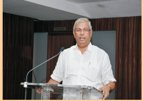
Sh. Rajendra Arlekar, Hon'ble Forest Minister addressing the gathering

The 64 th Wildlife Week was observed from 02 nd – 8 th of October, 2015 in the State. The first week of October every year is synonymous with Wildlife Week across the country. The main objective being to highlight the Biodiversity in the Wild through events that celebrate the Wildlife and provide a platform for the Forest Department to solicit the active engagement of all stakeholders with special emphasis on the youth and student community. Several programs were planned during the week by the Wildlife & Eco-tourism circle. The 64 th Wildlife week was unique in the sense that for the first time various competitive events were organized at five different venues across the State instead of organising in Panaji as was the practice till 2014. The five major towns of Panaji, Mapusa, Ponda, Margao and Vasco hosted the events. It enabled in eliciting a highly encouraging response from the educational institutions.