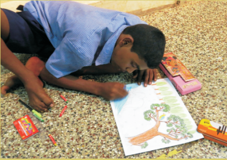
On-the-spot drawing competition