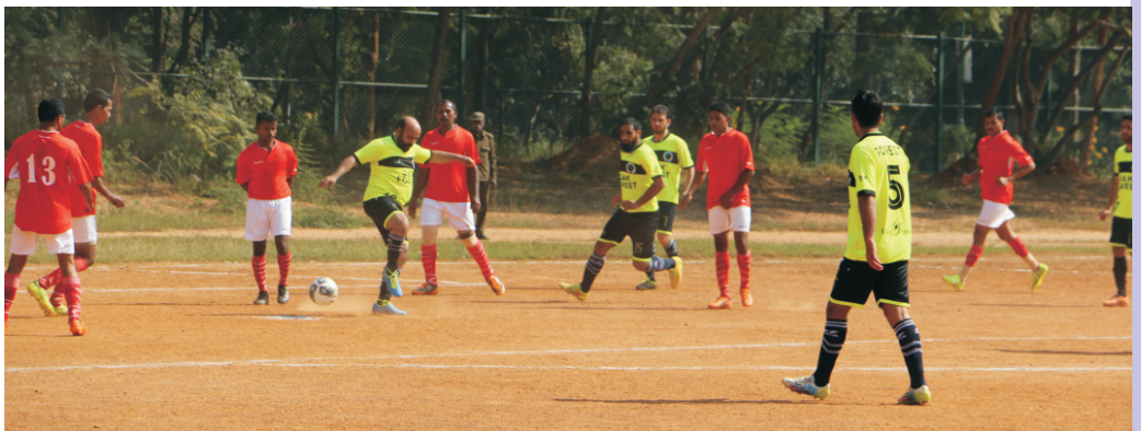
GOA Football team during their Final Match against J & K Team